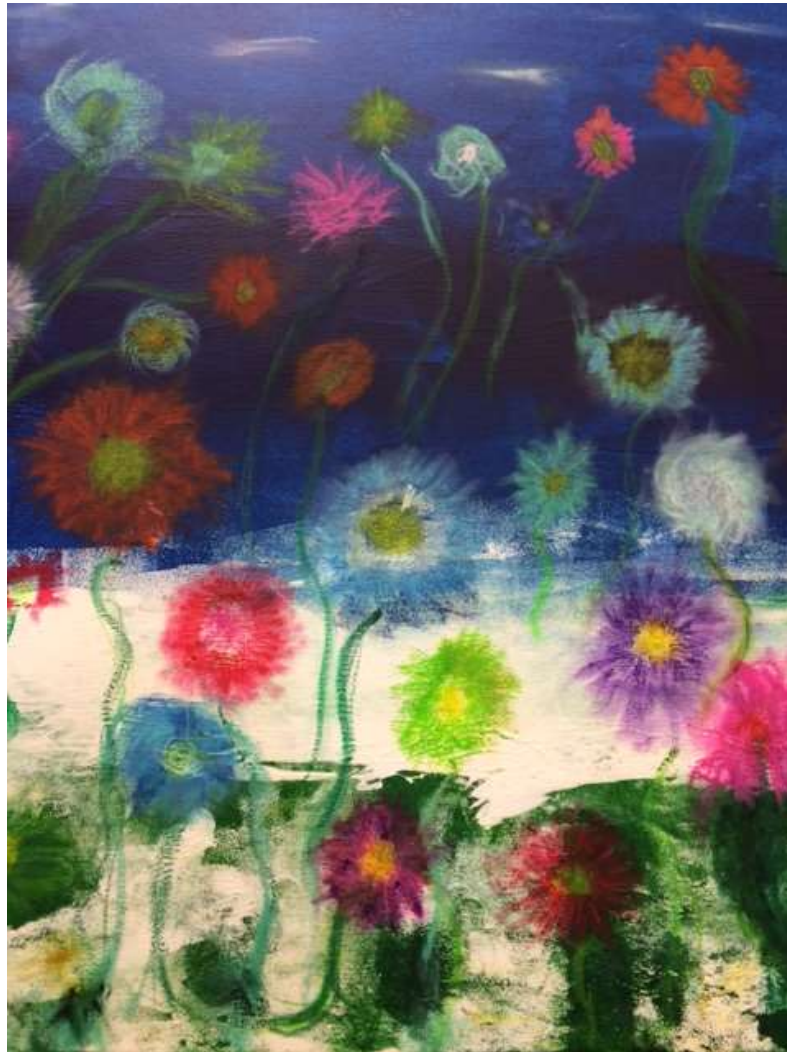
'Garden of Beauty' Class 1/2G Acrylic on Canvas, Balwyn Primary Arts Festival, November 2016

Nurturing global citizens for personal success in an ever-changing world